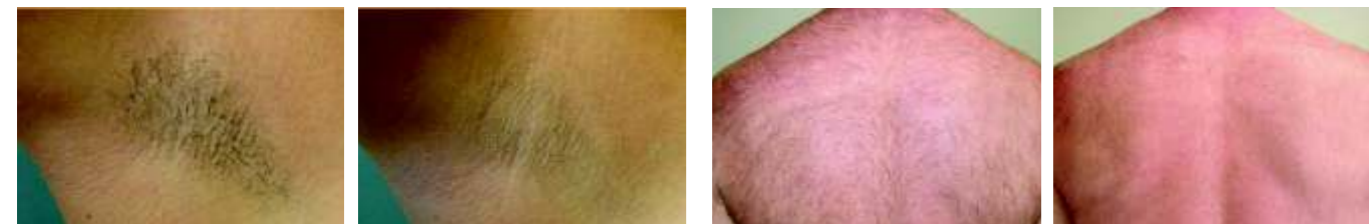
Highspeed Handpiece, one year follow-up post 5 treatments Highspeed Handpiece, 4 month follow-up post 4 treatments

The LightSheer technology by Lumenis has been validated in numerous clinical studies and peer reviewed articles. Thousands of satisfied customers have been and are still benefiting from the gold standard performance and patient satisfaction.